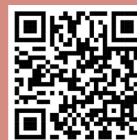
Scan for detailed Course Contents of MBA Executive (HCA)