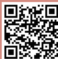
Scan for detailed Course Contents of MBA Executive

Students attend their classes in one of the two campuses of FMS (North and South Campus). The allocation of the campus is done by FMS.